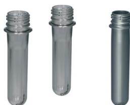
Plastic preform parison for PET bottle production